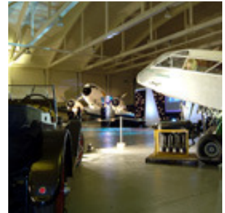
Science Museum Trip Wroughton