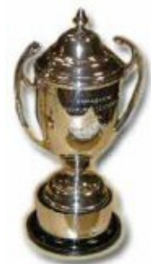
Oxfordshire Schools Computing Challenge Cup