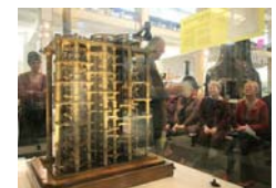
Babbage's Difference Engine Science Museum