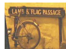
The Lamb & Flag